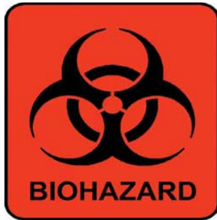
Figure 1: Biohazard Warning Symbol

As a general rule, the location of the posting is predicated by how access is gained to the area where biological hazards are used. In most cases, the door to any laboratory containing an infectious agent should have a biohazard warning symbol posted. In addition, postings should also be displayed in other areas such as biological safety cabinets, freezers, or other specially designated work and storage areas or equipment where potentially infectious agents are used or stored. All individual containers of biological agents should also be labeled to identify the content and any special precautionary measures that should be taken.